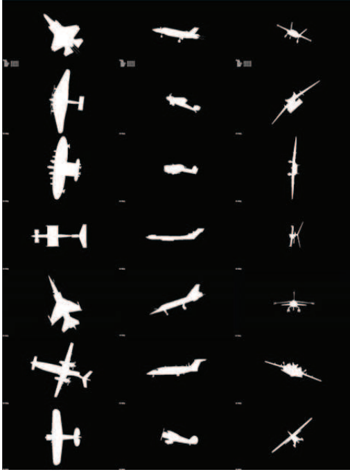
Fig. 3: Poses of different types of aircrafts.

93.5% of success with the PCR5-based SMF-ATR. In term of computational time, it takes between 5ms and 6ms to process each image in the sequence with no particular optimization of our simulation code, which indicates that this SMF-ATR approach is close to meet the requirement for real-time aircraft recognition. It can be observed that PCR5-based SMF-ATR outperforms DS-based SMF-ATR for 3 types of aircraft and gives similar recognition rate as with DS-based SMF-ATR for other types. So PCR5-based SMF-ATR is globally better than DS-based SMF-ATR for our application.